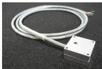
Rugged Package Sensors